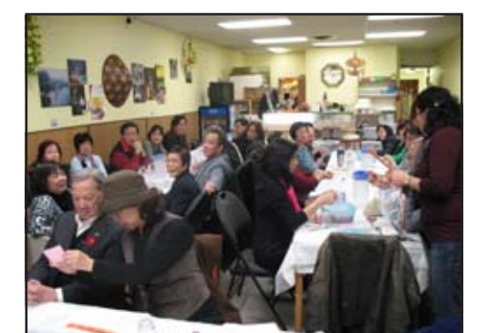
Some of the guests at the "Kawan-Kawan" Nite.