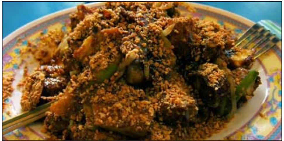
Ready to serve: "ROJAK"