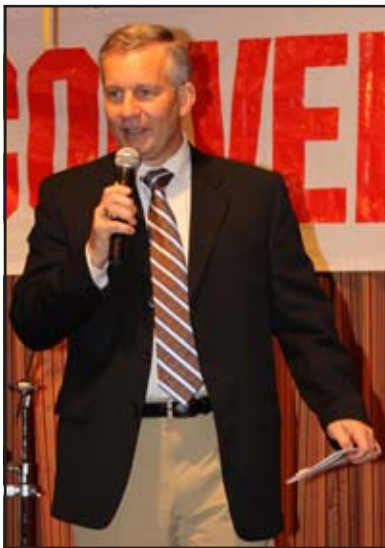
Guest-of-Honour Mr Ed Fast, MP for Abbotsford brought greetings from PM Stephen Harper to the guests.