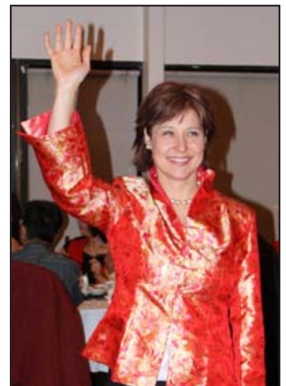
Ms Christy Clark waving to the guests on her arrival at the Chinese New Year celebration.