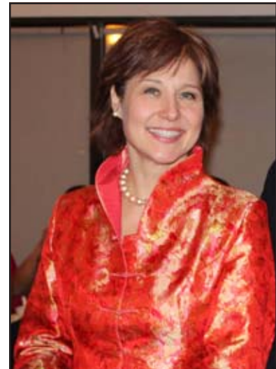
Christy Clark Premier