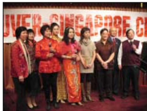
Ex-co members and guest singers welcome the "Year of the Rabbit" with traditional Chinese New Year songs.