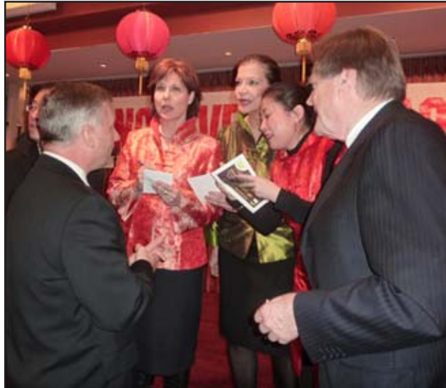
You can see that it is no easy task for all these judges to select the winners from among the lovely contestants seen in the picture below.