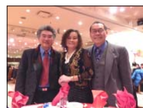
Members of the Club joined MSBCA in welcoming the Year 2011 at the Floata Restaurant.