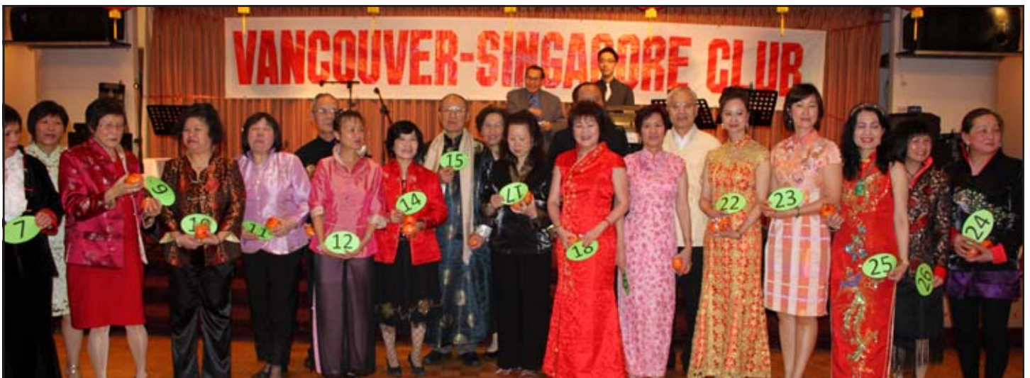
Some of the contestants in the Chinese New Year Costume Show.