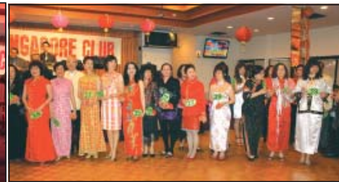
More of the lovely contestants in the Costume Show.