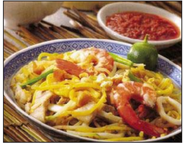
Fried Hokkien Mee

Prawns 1 kg (peeled and boiled - keep prawn heads for the stock) Squids 1 kg (cut into rings and boiled) Pork belly 500 g (slice into small strips) Bean sprouts 300 g Scallion 30 g