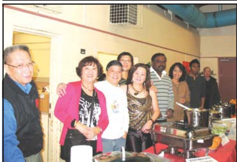
Thank you to all the cooks and helpers! Food at the Club's events is generous and ranks among the best in value.