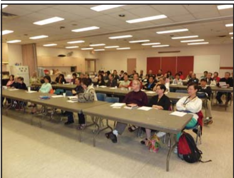
It's Serious Business at the AGM! Members listening intently to the proceedings.