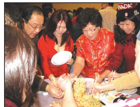
The "Lo-Hei" in Progress Members enjoying the traditional "Lo-Hei" of Yu-Sheng or Raw Fish Salad.