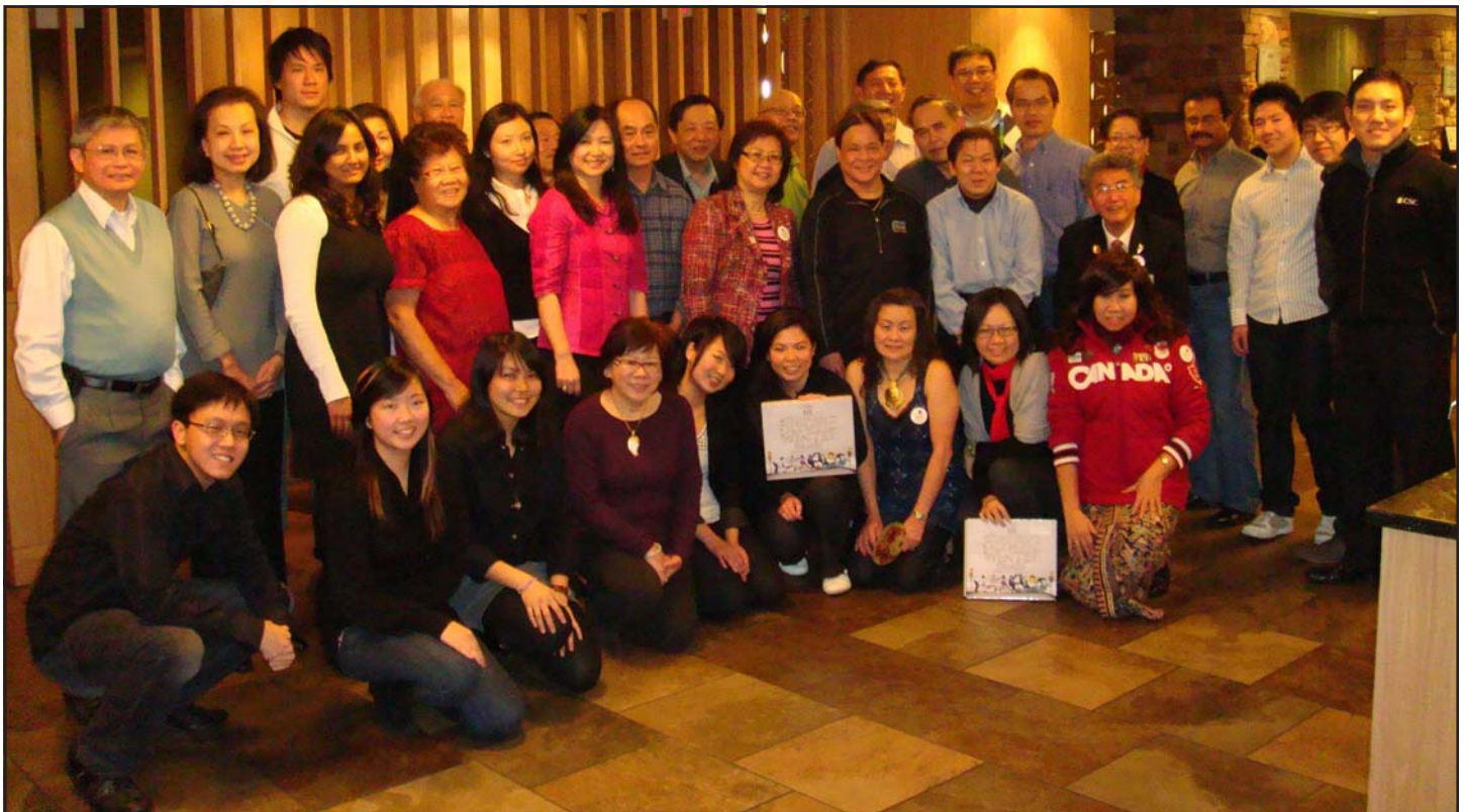
Officials from the Singapore Youth Olympic Games with members of the Club at the River Rock Buffet Restaurant, Richmond on February 9, 2010.