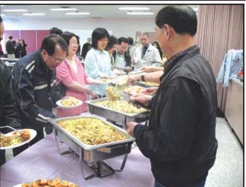
Here's the fun part! Members savouring the delightful food.