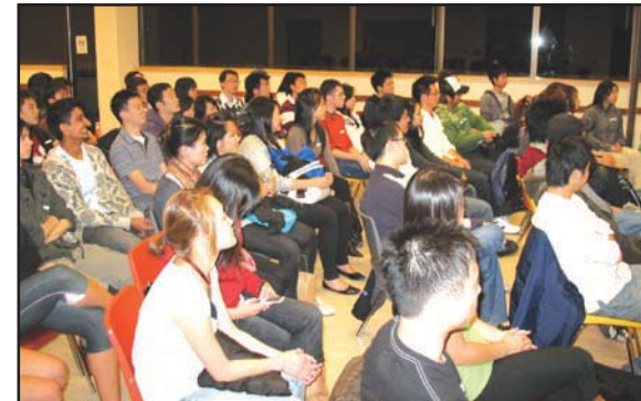
UBC students listening intently to the debate on a proposal to change the Club's name from Singapore Raffles Club to Singapore Students Association.