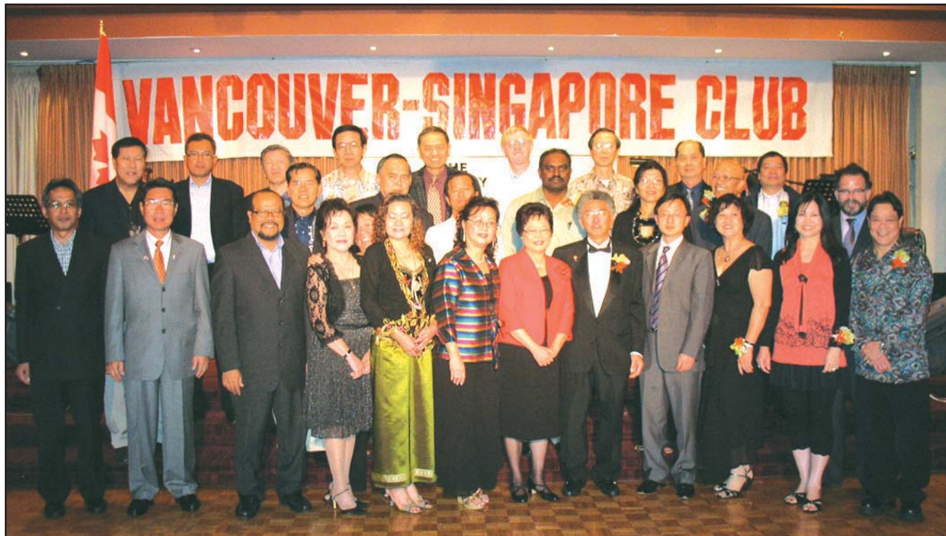
DIRECTORS OF VANCOUVER-SINGAPORE CLUB AND THE MALAYSIA SINGAPORE BRUNEI CULTURAL ASSOCIATION WITH VIP GUESTS AT THE JOINT CELEBRATION OF SINGAPORE'S 44TH NATIONAL DAY.