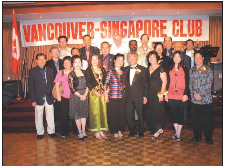
Joint Board of Directors from Vancouver-Singapore Club and The Malaysia Singapore Brunei Cultural Association at the event.