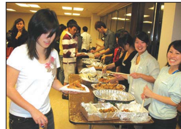
These students are showing us that dishing out the Singapore food is just as much fun as eating them.