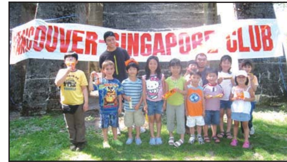
Students from SFU MSSC helping to entertain the kids at the picnic with games and prizes.