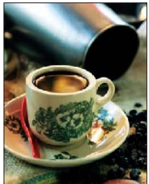
Coffee served in a traditional coffee cup.

(This same addendum also apply to Tea e.g. Teh-O).