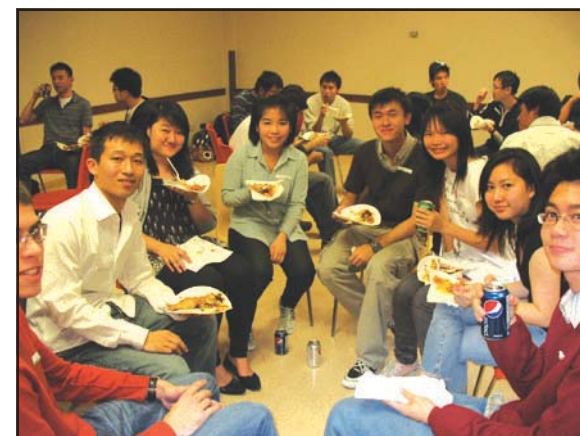
The Ice-breaker event is a good chance to make new friends and to savour the delicious Singapore food.