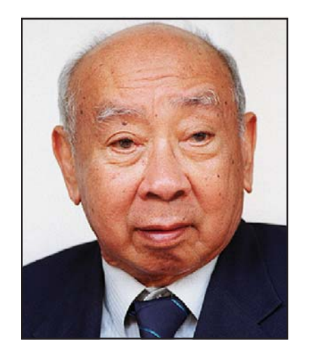
Dr Goh Keng Swee

Former Deputy Prime Minister and Singapore's economic architect Goh Keng Swee died on May 14, 2010 at the age of 91.