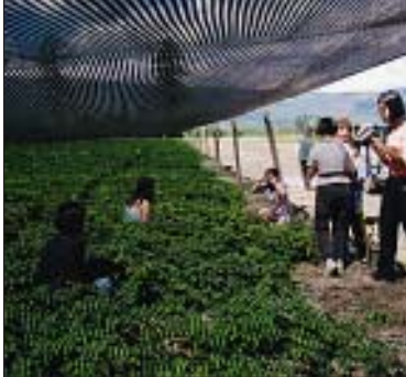
Nylon nettings protect the Ginseng from the sun's ray.