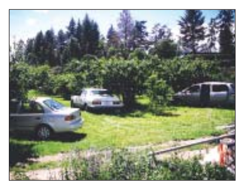
Our cars go right into the Cherry Orchard.

We arrived at West Bank, Okanagan at noon where we had lunch before proceeding into the cherry orchard. It was absolute delight for everyone as we picked and ate our way through the cherry orchard. After about 3 hours of cherry picking, we had to leave the West Bank and headed further inland to our overnight destination in Falkland.