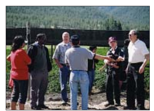
Visiting the Ginseng Farm in Falkland.