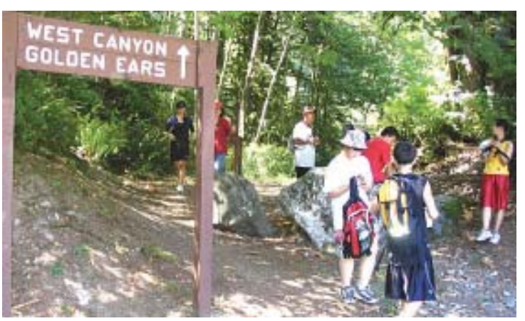
Campers preparing the hike up West Canyon, Golden Ears.

Apart for the 2 or 3 new families that were joining us for the first time in the camping trip, most seasoned campers knew what to do as soon as they arrived on site. The Park Warden held a list that we gave him to direct our campers to the campsites that were allotted. This made the settling in to the campsite much easier.